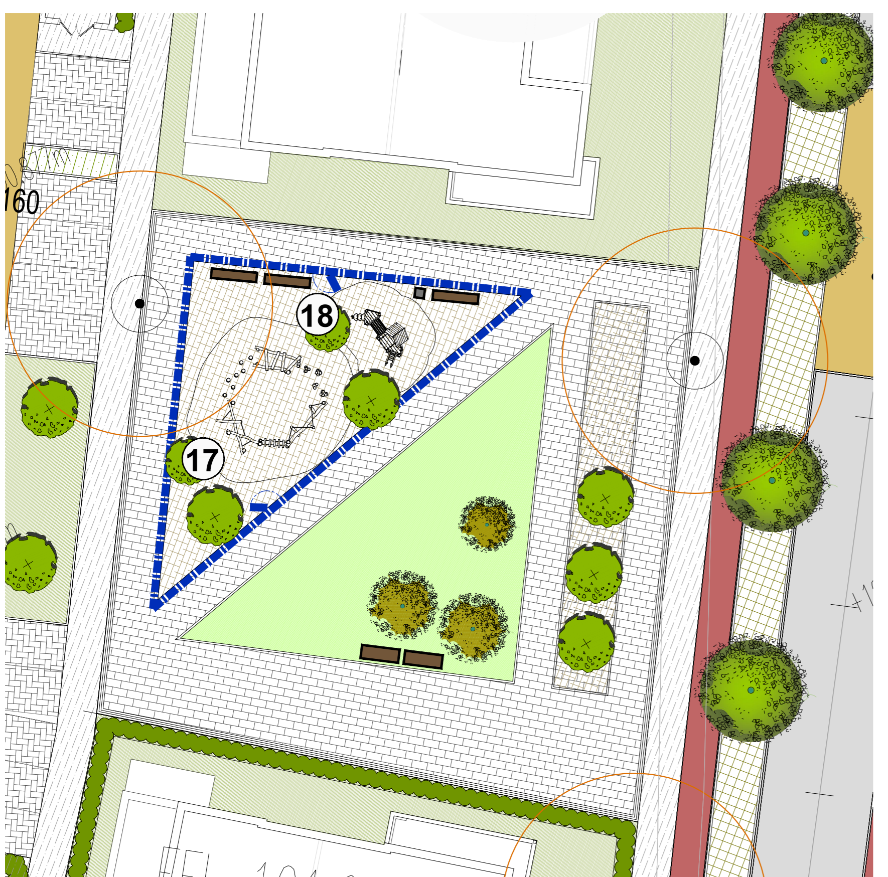
Play Area 4 Scale 1:200