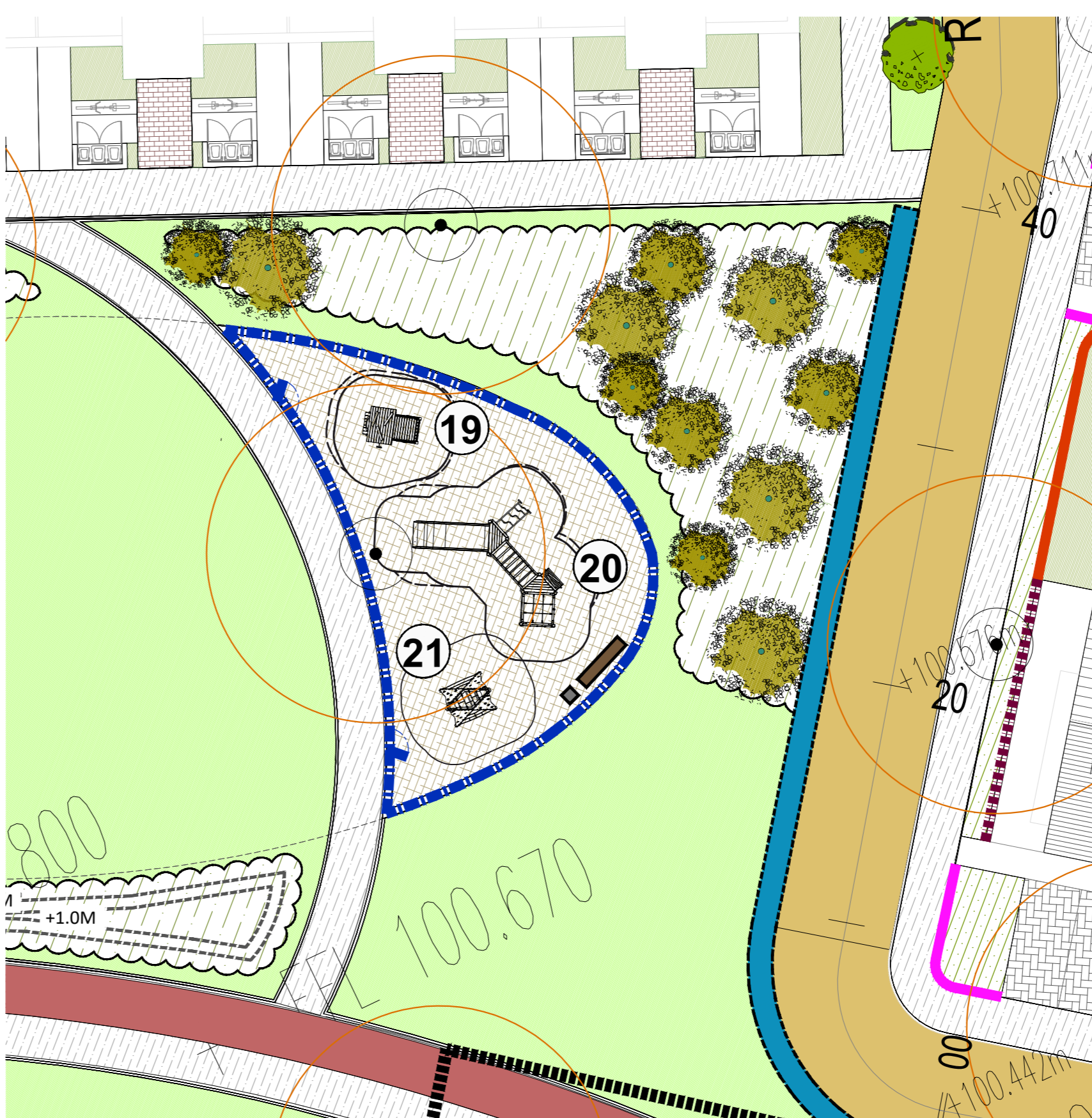
Play Area 5 Scale 1:200