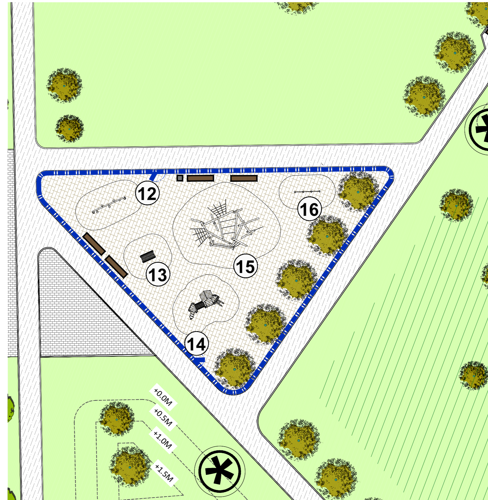
Play Area 3 Scale 1:200