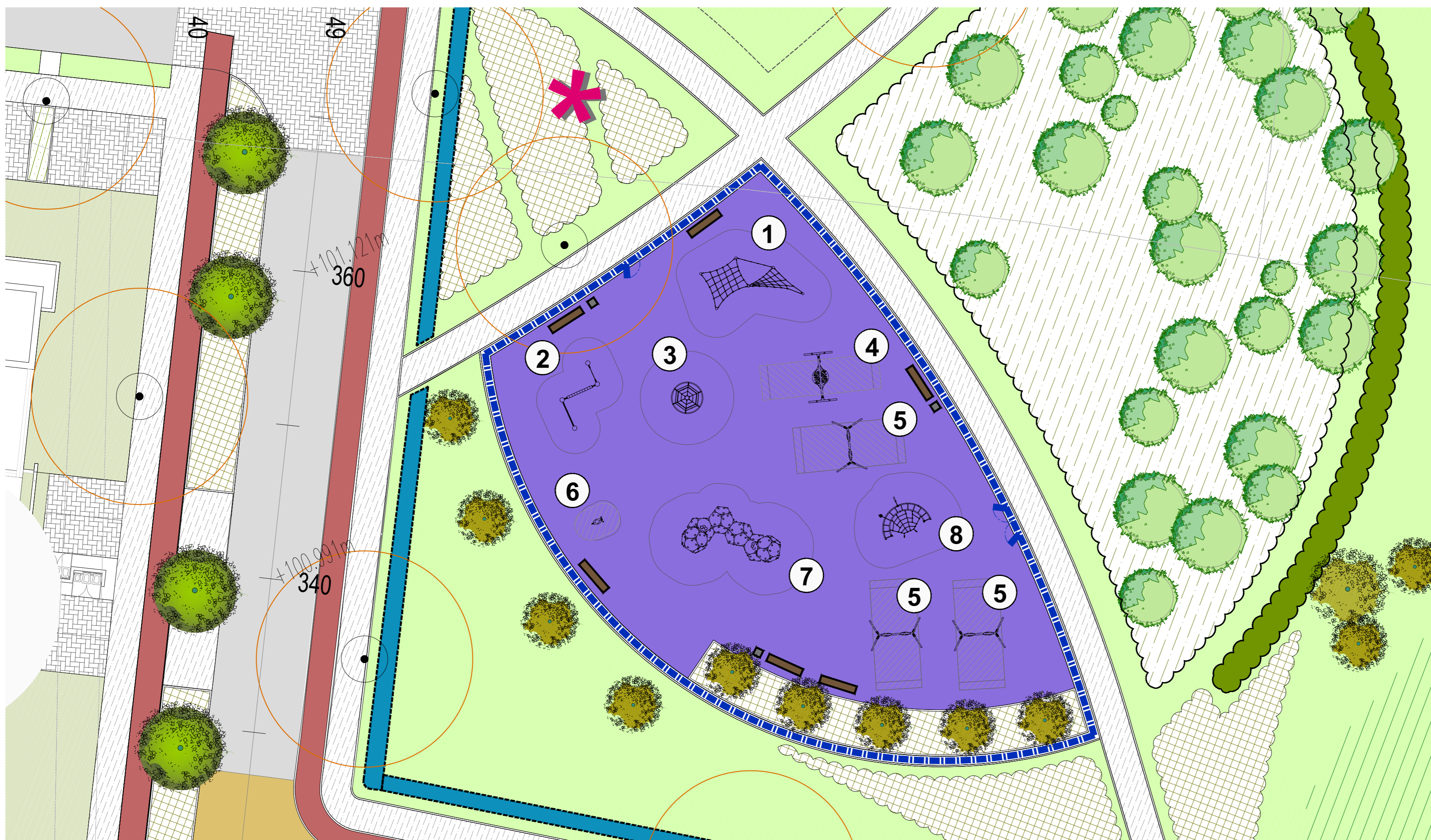
Play Area 1 Scale 1:200